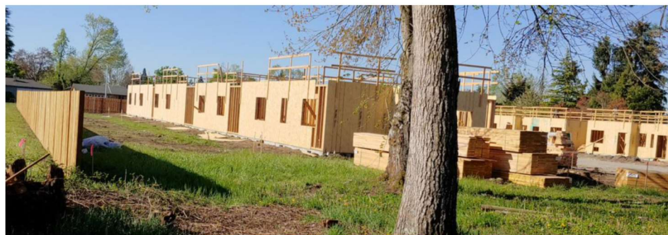
View from the Christ House back yard.