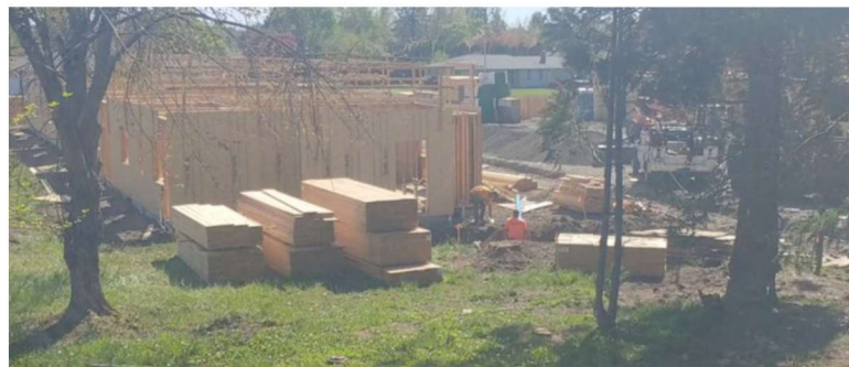
View from the upstairs at Christ House