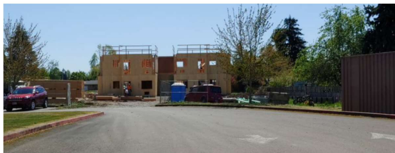
View from the west driveway.

If you have been by the church, you have noticed a lot of construction is taking place. This means that within the next 6 months or so we will begin to see our new neighbors moving into the apartments and homes behind the church. God has a plan for them and us. Let us pray for both our futures as we welcome them into our community and invite them into our church family.